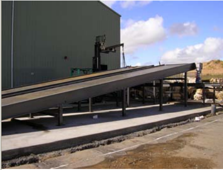
Snap Shots of the new facility