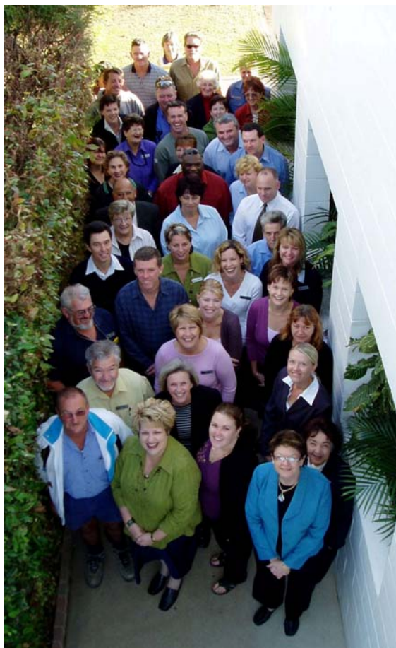
IMPACT Make Your Mark Staff 2006