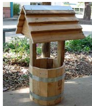
Carpentry Project Kepnock is making toys and wooden articles such as this wishing well.