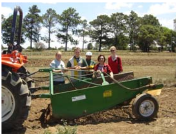
Business Venture A Potato Digger was provided for Kepnock's Agricultural Department