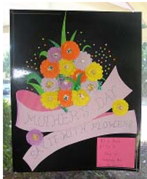
One-off Project Bundaberg Christian College designed this poster to advertise their Mother's Day Flower sale