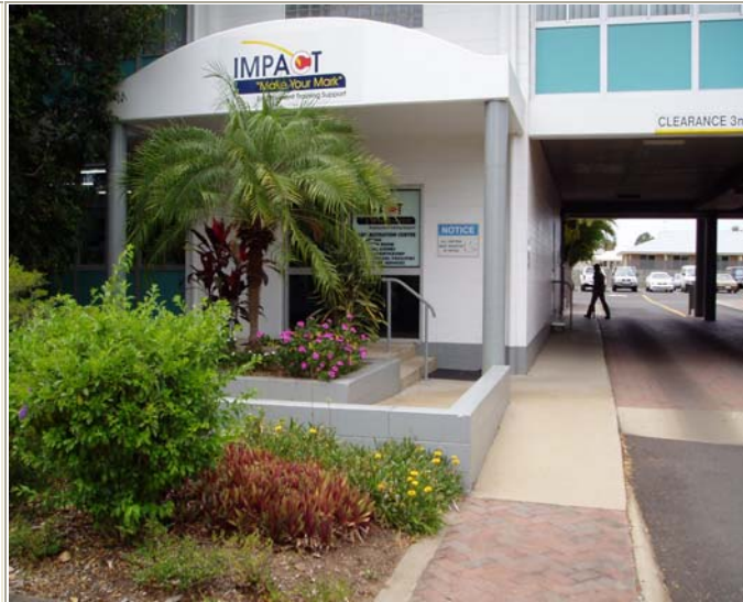
106 – 108 Bargara Road, Bundaberg